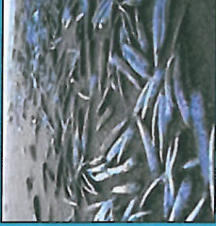
Kematian pelbagai spesies hidupan akibat pencemaran Death to various living species due to pollution