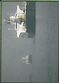
Aktiviti perkapalan Shipping activities