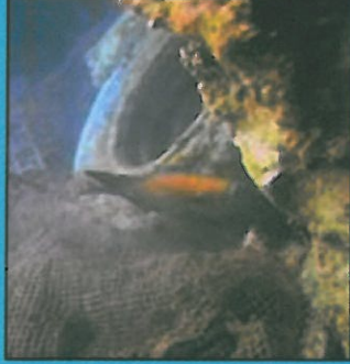
Kemusnahan terumbu karang yang merupakan habitat hidupan akuatik Destruction of coral reefs that serve as aquatic life habitat