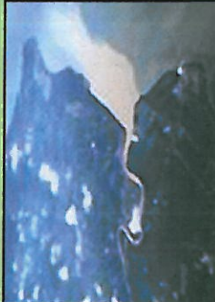
Pencemaran dari punca di daratan Pollution occurrences from land-based sources