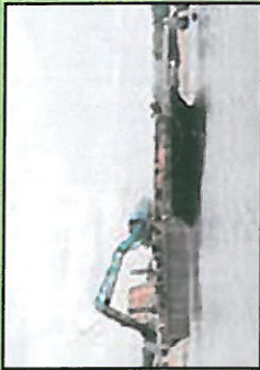
Aktiviti penambakan di laut Embarkment activities at sea