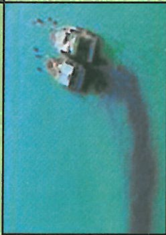
Tumpahan minyak dari kapal Oil spill from ships