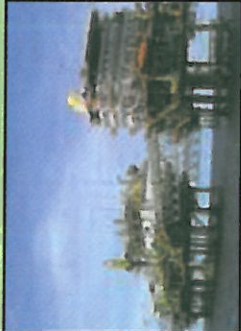
Aktiviti penggerudian dan carigali minyak Oil exploration activities