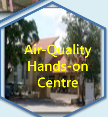
Air-Quality Hands-on Centre