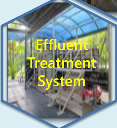
Effluent Treatment System