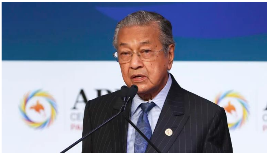
Malaysian Prime Minister Mahathir Mohamad.

On Friday evening, he told the local media that companies interested in acquiring Lynas have agreed to extract radioactive waste before importing it to the Lynas processing plant in Malaysia and he indicated this additional measure would be required if Lynas wants its licence renewed in September.