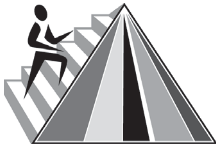
Figure 4.1 New Food Pyramid Graphic— www.MyPyramid.gov

The new graphic shifts the emphasis away from best food choices to a new food democracy where every food is equal. It is provoking many questions. More than half of all consumers in a nationwide survey responded that they were confused and unclear about how to follow the new pyramid.