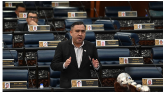
MALAYSIA Transport minister says companies have...