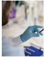
MALAYSIA Free influe vaccinatio