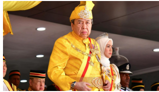
MALAYSIA Selangor Sultan calls on assemblymen to focus...